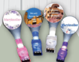
Maryknoll's Symphony of Light