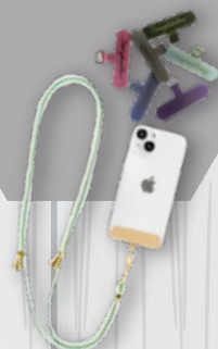
Crossbody Phone Strap