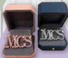
MCS 100 Brooch