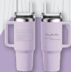
Stainless Steel Tumbler