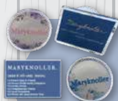
Phone Airbag Holder