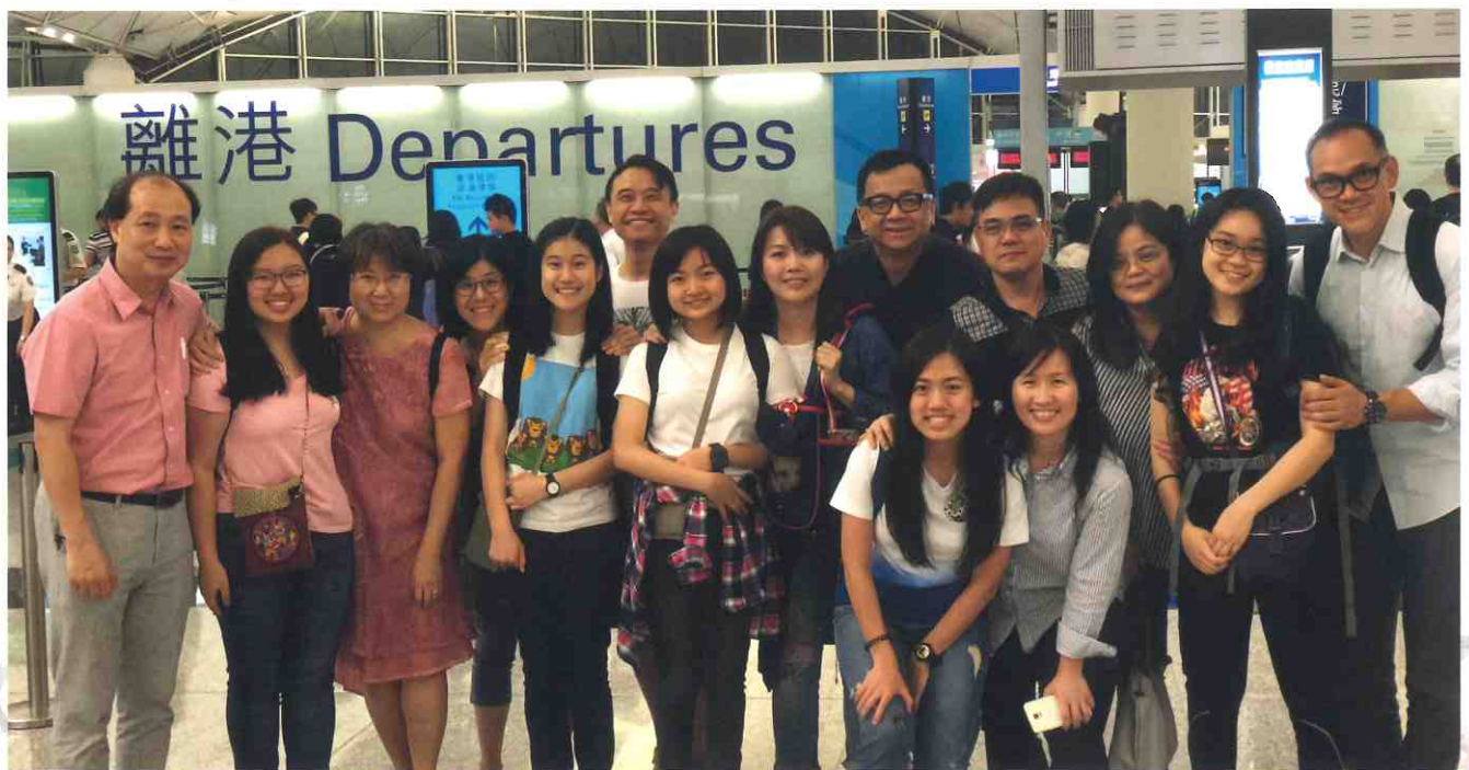
Graduation trip to Korea 2018